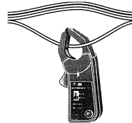
Fig. 2. Illustration of single wire clamped for current measurement.